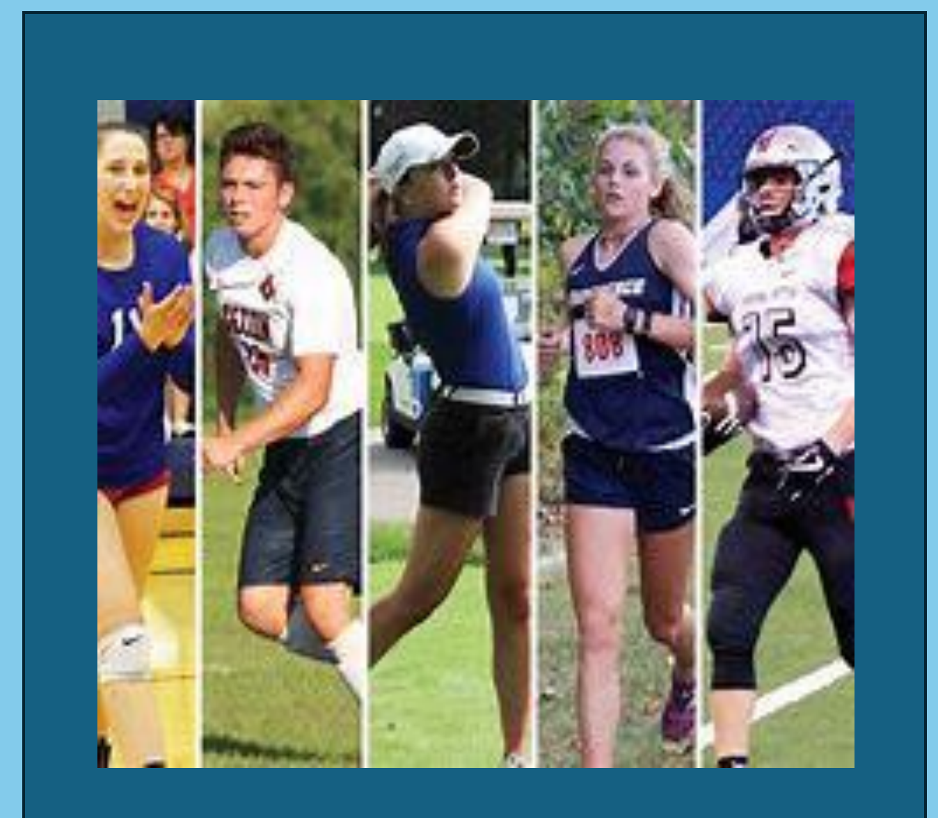
High School Athletes